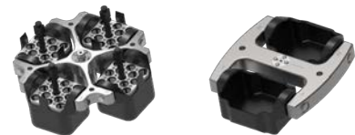
Swing-out rotor 4-place | 2-place