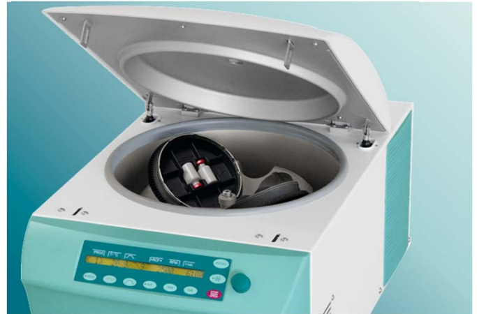
ZentriMix 380 R

Since liposome manufacturing using the ZentriMix 380 R is a fast and sterile process, the preparation of liposomes with limited shelf lives for immediate use is possible as well. This principally allows the investigation of „per-se” instable but promising liposomes and – in a later step – its clinical investigation and use (bed-side-preparation).